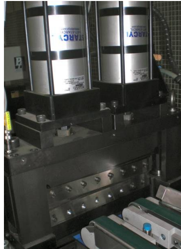
Fig. 5 Pneumatic scissors with angled blades.