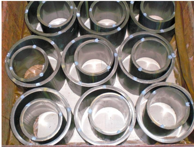
Fig. 2 Stator and rotor packets of position induction sensor.

For the production of stators and rotors (Fig. 2) in the electrical industry the sheets from isotropic dynamo steel are widely used. The sheets are supplied either in the final processing or in the pre final where the material is in development state. For the production of static electrical machines, mainly transformers, transformer steels are used with oriented structure, which is characterized by the minimum watt losses in the longitudinal direction. At the production of plates for inductive position sensors and for generators it is useful to choose sheets and strips material from isotropic dynamo steels for electrical engineering cold-rolled in the final processed state.