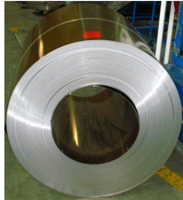
Fig. 3 Roll of the strip of isotropic electrical steel M400-50A according to EN 10106 with thickness of 0.50 mm, which was used for comparison of the cutting tools functional parts life.

According to the requirements on the electrical rotating machines production and also customers requirements like the most suitable material for the life of cutting tools comparison the sheet M400-50A according to EN 10106 (Tab. 1.1), which is isotropic for electrical steel sheet with a maximum specific losses p = 4,00 W/kg at 1.5 T and 50 Hz, with a nominal thickness of t = 0.50 mm supplied in heat-processed state, was selected